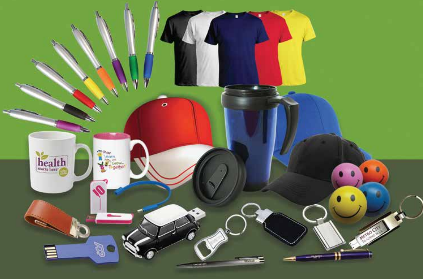
Promotional gifts or advertising gifts (branded with a logo or slogan) used in marketing and communication programs.